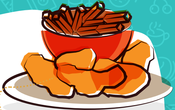
CHICKEN GOUJONS With skinny fries and dip